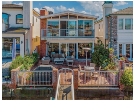
3810 CHANNEL Lido Isle | $8,950,000 | $25,000/Month