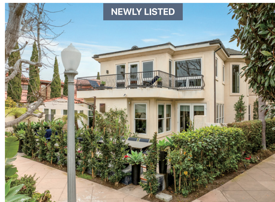
201 Via Cordova, Lido Isle List Price: $6,199,000 / Rep. Seller