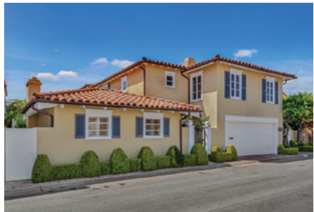
209 VIA DIJON Lido Isle | $5,995,000 Represented Buyer & Seller