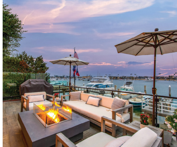
815 VIA LIDO SOUD | LIDO ISLE 5 Bed | 5.5 Bath | 3,809 SF | 3,120 SF Lot $15,995,000 | $33,000/Month