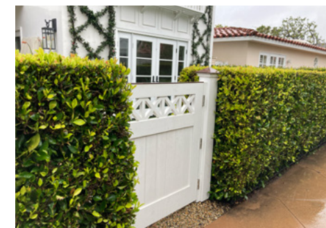
Example of a high hedge and gate

Many residents that desire more privacy have enclosed their yard areas with high hedges and gates. To address this desire for privacy, a number of years ago, our CC&Rs were changed to allow higher hedges than were previously allowed. Hedges along the strada can now be as high as five feet tall.