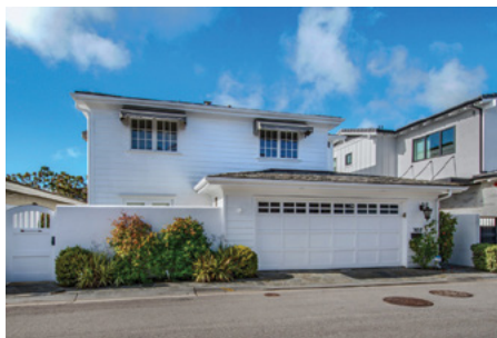
207 VIA MENTONE Lido Isle | $4,395,000 Represented Buyer & Seller