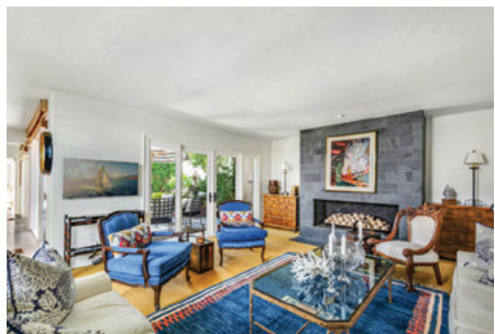
212 VIA KORON Lido Isle | $4,895,000 Represented Seller