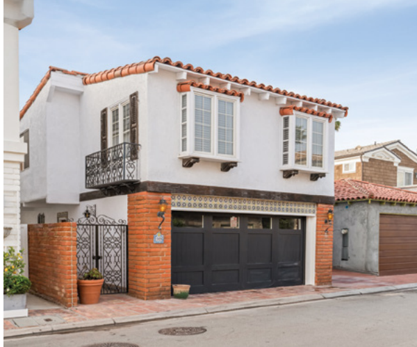
109 VIA RAVENNA | LIDO ISLE 3 Bed | 3 Bath | 2,260 SF | 2,640 SF Lot $3,995,000