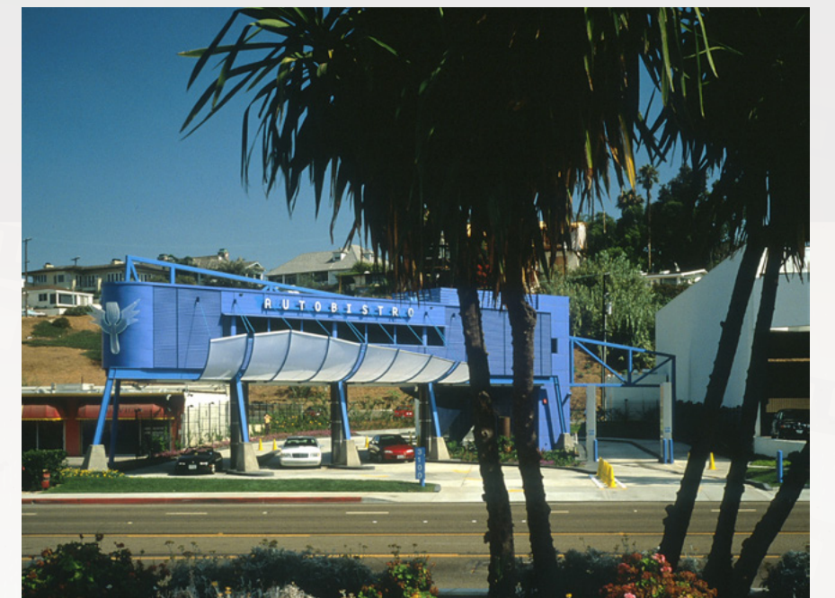
Auto-Bistro during its "blue period". Thanks so much to Mark VanderZanden of Surround Architecture in Portland, OR for the use of all these great photos.

Another unique thing about Autobistro was the menu. It was not your typical fast food. While certain members of Old Isle's family fondly remember mini-corn dogs and warm chocolate chip cookies, the adult menu was more sophisticated with chicken apple sausage biscuits for breakfast, paninis for lunch and a selection of pot pies for dinner. Other favorites were Caesar salad, apple tartlets and Chinese chicken salad. Old Isle has particularly happy recollections of the gazpacho, which was served in a cup, and is surely one of the most convenient and nutritious car-friendly foods ever. The menu was developed by Seattle chef, Kathy Casey. She still has a restaurant at Sea-Tac airport called Rel-Lish Burger Lounge, as well as other food-related businesses in the Seattle area. So if you still crave Autobistro cuisine, possibly you still have a chance to sample it!