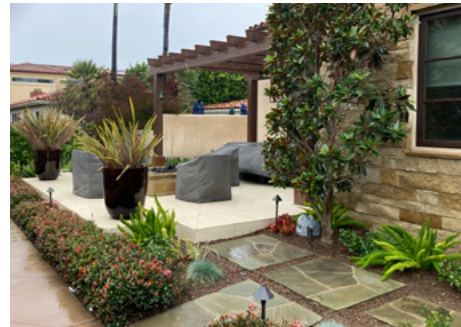
Example of an open yard

While many homes have utilized the areas adjacent to the strada as open, inviting areas for sitting and entertaining with little or no walls and gates. Other neighbors have tried to create more of a sanctuary enclosed by hedges and gates. LICA's CC&Rs were written to maintain the stradas as visually open to the surrounding homes and the sky. Hedges, gates, walls and trees were intended to be low and set back by at least two (2) feet from the edge of the sidewalk, outside of the City's two-foot easement. Trees were meant to be trimmed to afford pedestrians an unobstructed line of sight down the length of the strada.