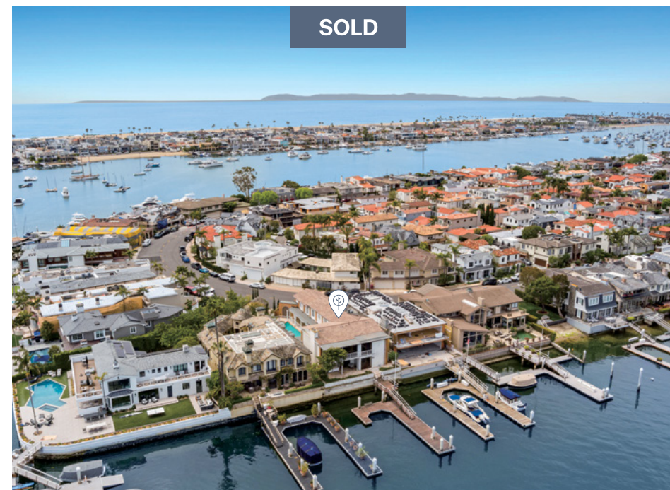
924 Via Lido Nord, Lido Isle List Price: $19,750,000 / Rep. Seller