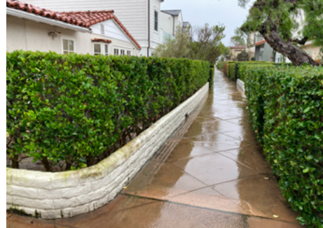
Example of a wall built into city easement

For additional security, many have installed higher gates than the maximum thirty inches currently allowed by our CC&Rs. It should be noted that any hedges above five feet or gates higher than thirty inches are subject to violation notices and fines by the Lido Isle Community Association.