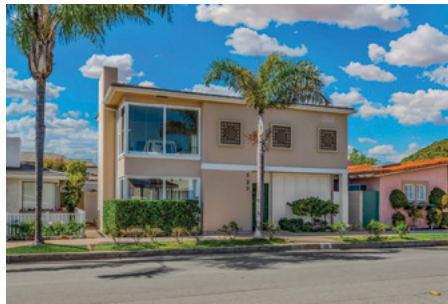
125 VIA GENOA Lido Isle | $4,695,000 Represented Buyer & Seller