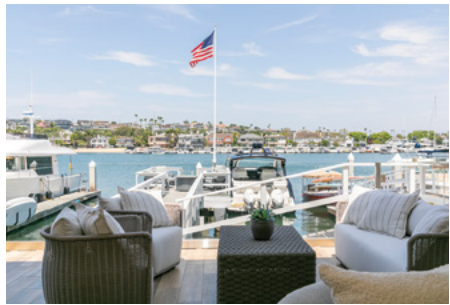
704 VIA LIDO NORD Lido Isle | $16,995,000 Represented Seller