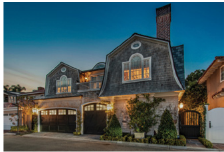
135 VIA YELLA Lido Isle | $8,295,000 Represented Buyer & Seller