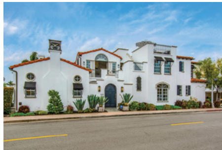
620 VIA LIDO SOUD Lido Isle | $5,675,000 Representing Seller