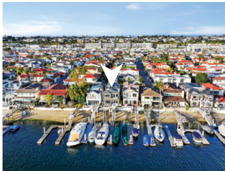
COMING SOON | 517 VIA LIDO SOUD Lido Isle | Bayfront with Dock