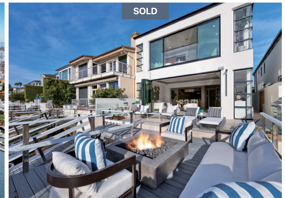
235 Via Lido Soud, Lido Isle List Price: $12,600,000 / Rep. Buyer & Seller