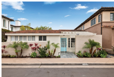
122 VIA KORON Lido Isle | $3,475,000 Represented Buyer