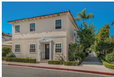
119 VIA SAN REMO Lido Isle | $4,195,000 Represented Seller