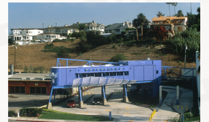
A more general view of the area. Was it really 25 years ago?

Another unique thing about Autobistro was the menu. It was not your typical fast food. While certain members of Old Isle's family fondly remember mini-corn dogs and warm chocolate chip cookies, the adult menu was more sophisticated with chicken apple sausage biscuits for breakfast, paninis for lunch and a selection of pot pies for dinner. Other favorites were Caesar salad, apple tartlets and Chinese chicken salad. Old Isle has particularly happy recollections of the gazpacho, which was served in a cup, and is surely one of the most convenient and nutritious car-friendly foods ever. The menu was developed by Seattle chef, Kathy Casey. She still has a restaurant at Sea-Tac airport called Rel-Lish Burger Lounge, as well as other food-related businesses in the Seattle area. So if you still crave Autobistro cuisine, possibly you still have a chance to sample it!