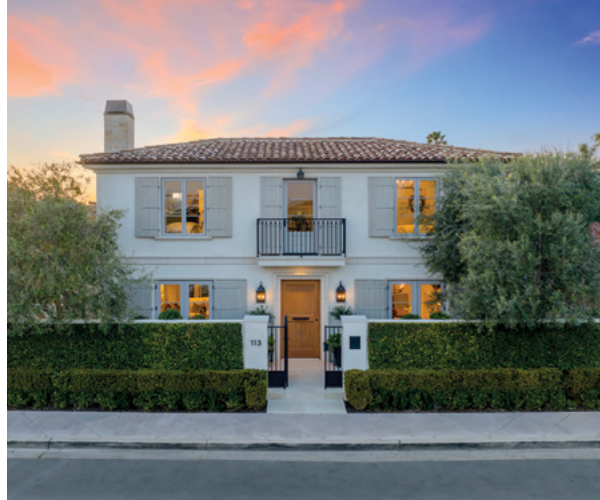
NEW LISTING | 113 VIA SAN REMO | LIDO ISLE 4 Bed | 3.5 Bath | 3,700 SF | 3,960 SF Lot $8,950,000