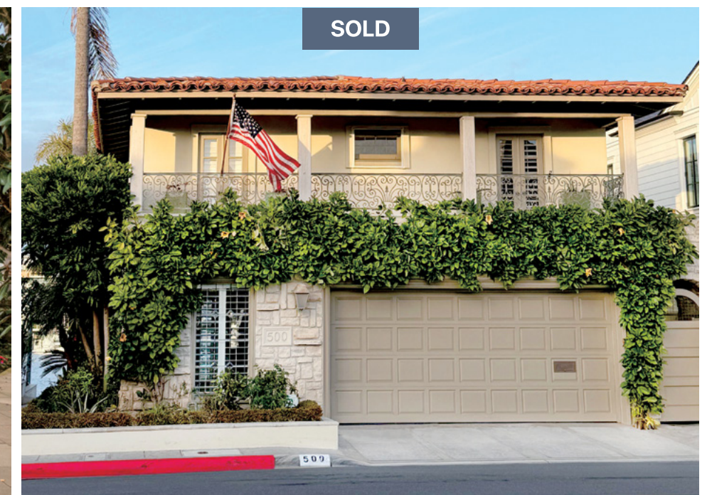
500 Via Lido Nord, Lido Isle List Price: $15,995,000 / Rep. Buyer