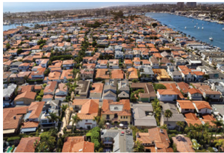
202 VIA PALERMO Lido Isle | $6,200,000 Represented Buyer