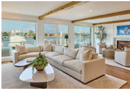
820 VIA LIDO NORD Lido Isle | $22,500,000 Represented Buyer