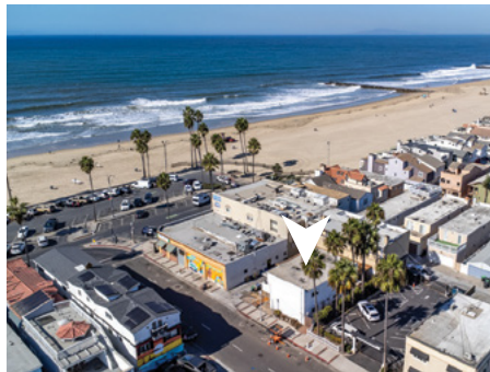
COMING SOON | 107 23RD STREET 4 Units/Mixed Use