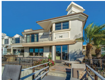
323 VIA LIDO SOUD Lido Isle | $25,000/Month