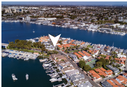
203 VIA LIDO SOUD Lido Isle | Off-Market Represented Seller