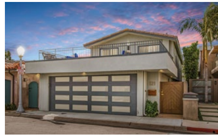
121 VIA UNDINE $3,300,000