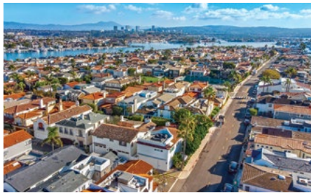
636 VIA LIDO SOUD $3,450,000