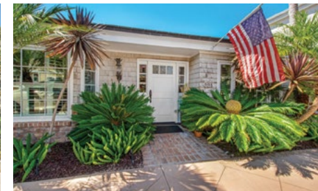
221 VIA GENOA $4,100,000