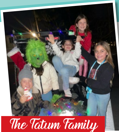
The Tatum Family