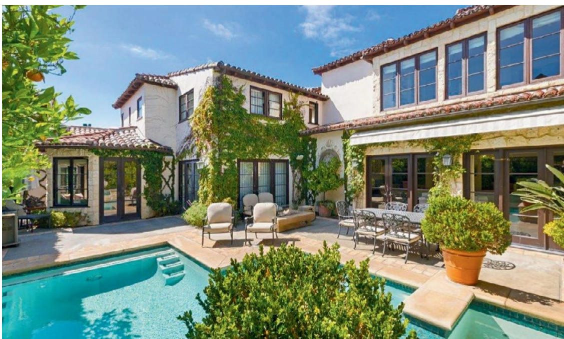
110 VIA TRIESTE, NEWPORT BEACH | OFFERED FOR SALE | PRICE UPON REQUEST 5 bedrooms | 5 1/2 bathrooms | 5,507 approx. s.f. | 3 car garage