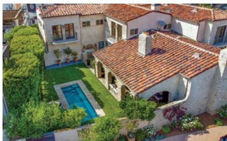
123 VIA FLORENCE $8,800,000