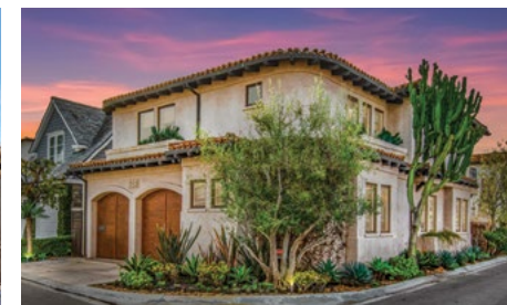
912 ZURICH CIRCLE $4,850,000