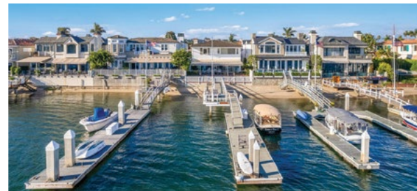
751 VIA LIDO SOUD $11,200,000