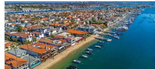
VIA LIDO SOUD $11,200,000