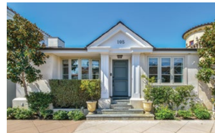
105 VIA WAZIERS $4,250,000