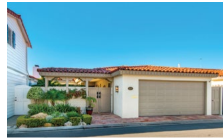
217 VIA MENTONE $3,300,000