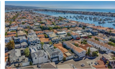
125 VIA HAVRE $3,300,000