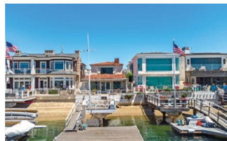
529 VIA LIDO SOUD $7,000,000