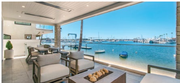
365 VIA LIDO SOUD $13,500,000