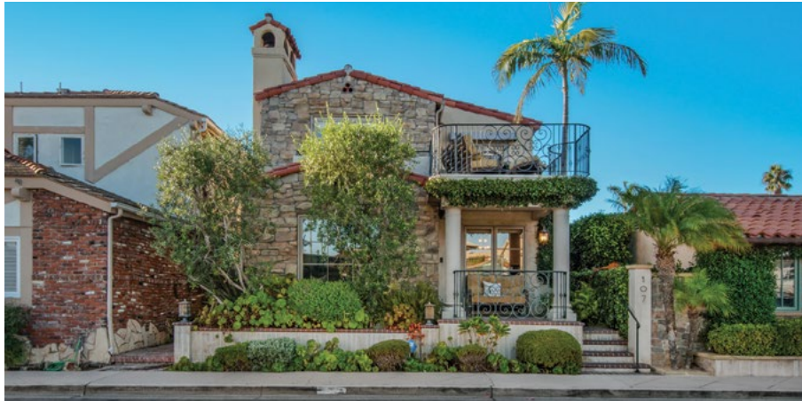
107 VIA SAN REMO LIDO ISLE | $13,995/MONTH 4 BR | 4 BA | 2,700 SF