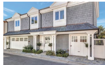
117 VIA QUITO $6,000,000