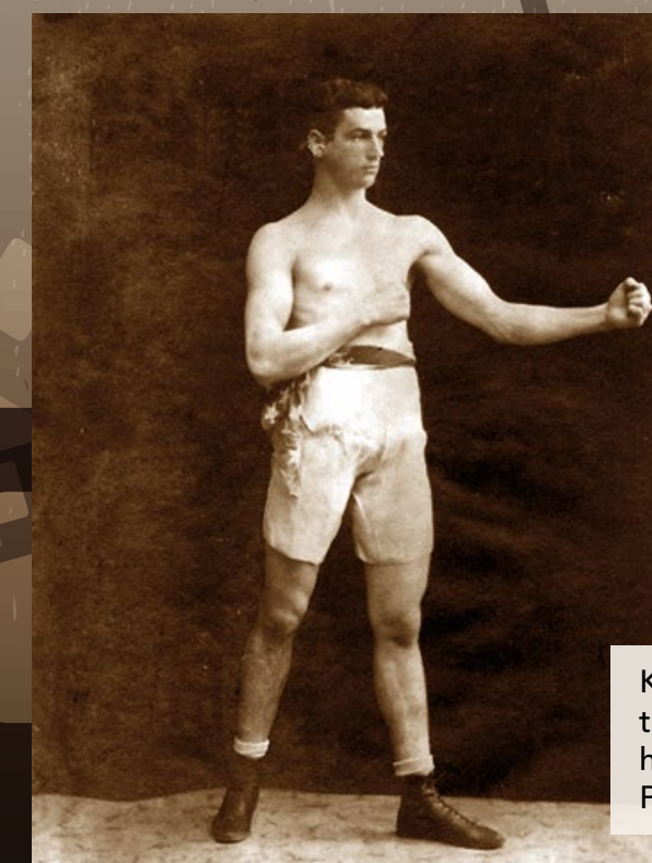
Kid McCoy in happier times, famous for his corkscrew punch.