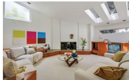
125 VIA VENEZIA $4,500,000