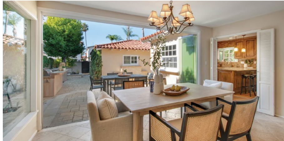
119 VIA SAN REMO LIDO ISLE | LISTED AT $4,195,000 4 BR | 4 BA | 2,150 SF