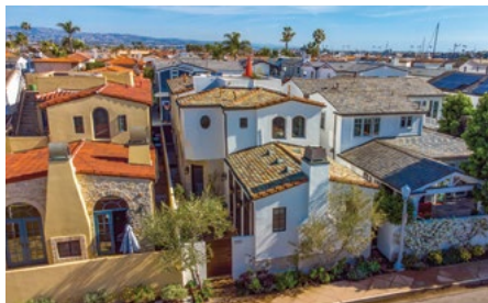
110 VIA ORVIETO $4,600,000