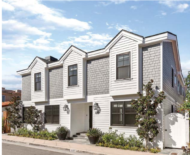
119 Via Koron, Lido Isle $4,200,000 | 5-BR, 5-BA | Web# 18247805