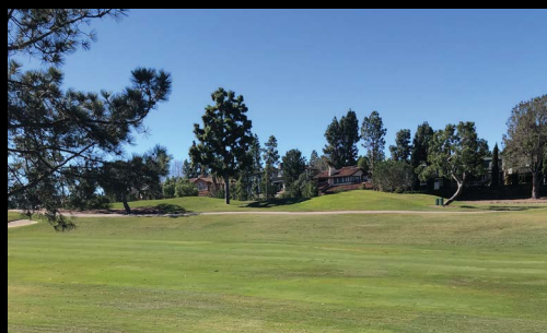
205 Bay Hill Drive 3 Bed | 3 Bath | Golf Course Views | $1,400,000*