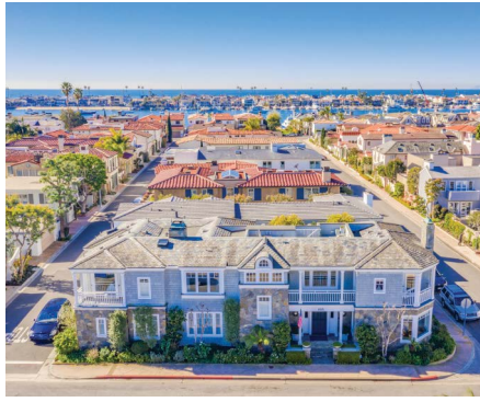
805 VIA LIDO NORD | IN ESCROW Lido Isle | Offered at $5,679,000 5 Bed | 4.5 Bath | 4,660 Approx. Sq. Ft. Representing Seller