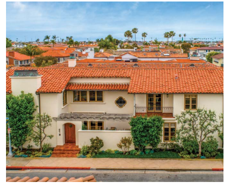
441 VIA LIDO NORD | NEW LISTING Lido Isle | Offered at $3,295,000 4 Bed | 4.5 Bath | 3,320 Approx. Sq. Ft.