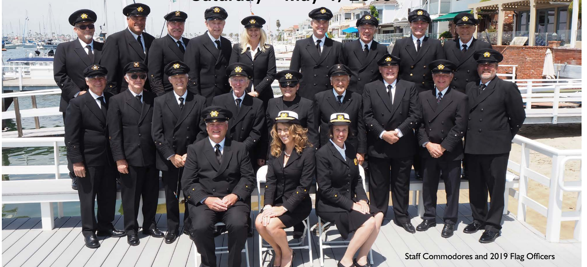
Staff Commodores and 2019 Flag Officers