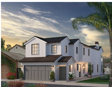
VIA LIDO NORD - LIDO ISLE Under Construction - Private Residence