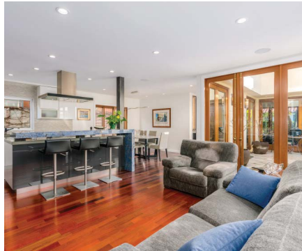
120 VIA QUITO Lido Isle | Offered at $2,599,000 3 Bed | 2.5 Bath | 2,199 Approx. Sq. Ft.