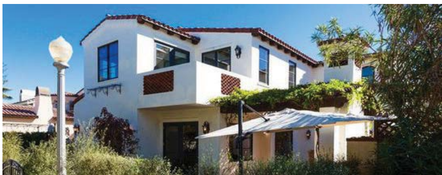
215 VIA RAVENNA FOR LEASE ($14,500/MO)