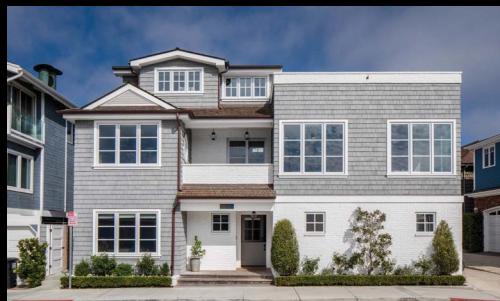
108 11th Street 3 Bed | 3.5 Bath | Ocean views | $3,150,000