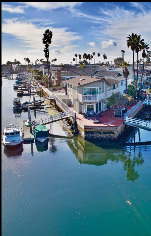
3700 Channel Place 4 Bed | 3 Bath | 2 docks | $2,995,000