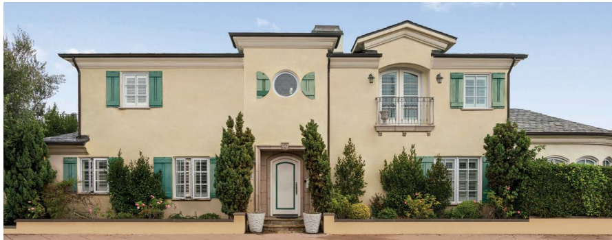
215 VIA LIDO SOUD SOLD REPRESENTED BUYER