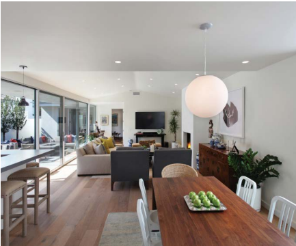
206 VIA KORON Lido Isle | Offered at $3,095,000 3 Bed | 2.5 Bath | 2,500 Approx. Sq. Ft.