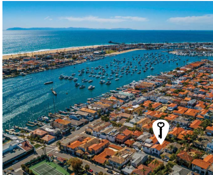
117 VIA RAVENNA | JUST SOLD Lido Isle | Offered at $2,695,000 3 Bed | 2 Bath | 1,700 Approx. Sq. Ft. Represented Seller