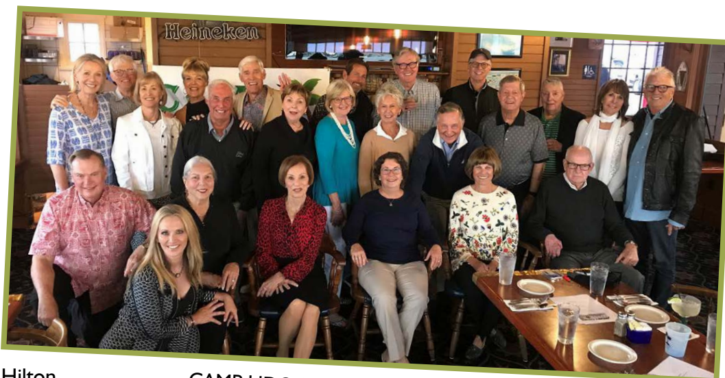
CAMP LIDO 2019 – A great time was had by all at the Hilton Waterfront in Santa Barbara

The LITC Awards dinner was held at the Moby Dick restaurant on Saturday night and everyone seemed to come away something in addition to enjoying great food, drinks and conversation. If you missed CAMP LIDO this year, 2020 is certain to have something fabulous in store. Stay tuned!!!