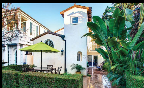
105 Via Yella 3 Bed | 3 Bath | 30' lot | 8,000/mo*