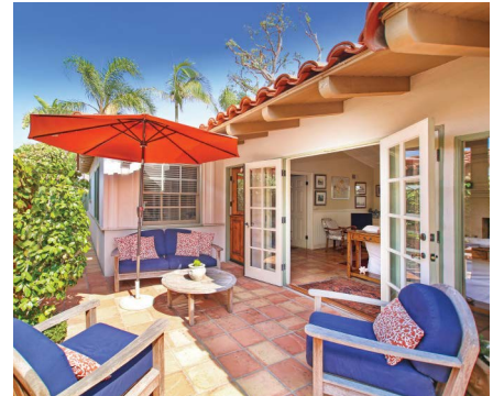
207 VIA FIRENZE Lido Isle | Offered at $2,245,000 3 Bed | 2 Bath | 1,310 Approx. Sq. Ft.