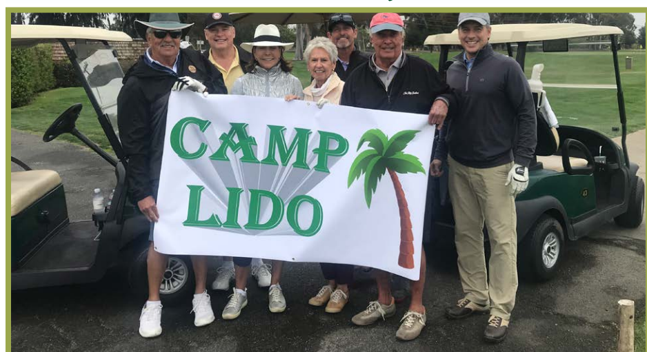
CAMP LIDO 2019 - GOLFERS ENJOYING THE SANDPIPER GOLF COURSE IN SANTA BARBARA