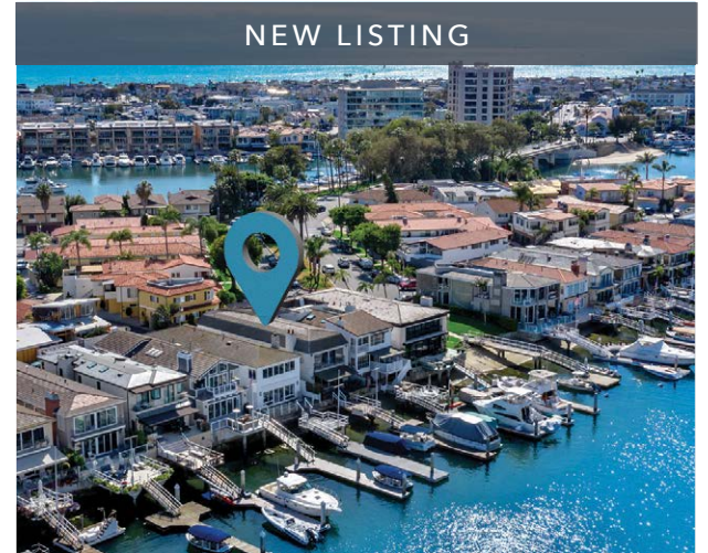
206 Via Lido Nord, Lido Isle $4,895,000 | 5-BR, 4.5-BA | Web# 19107246