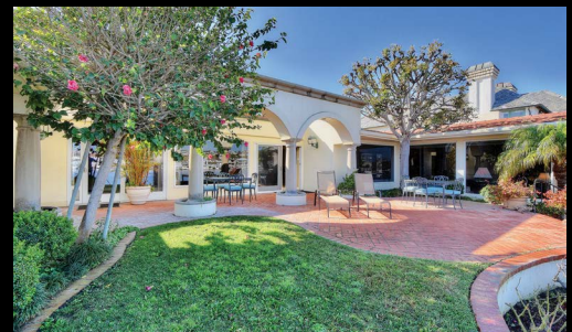
756 Via Lido Nord 4 Bed | 4.5 Bath | Private Dock | $17,500/mo