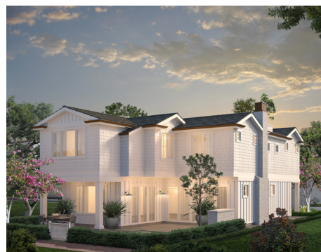
VIA ITHACA - LIDO ISLE Under Construction - Available

Pat Patterson | Owner info@sailhouse.com 949.281.6044