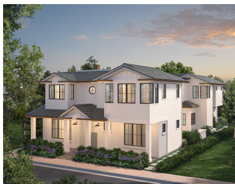
VIA HAVRE - LIDO ISLE Under Construction - In Escrow