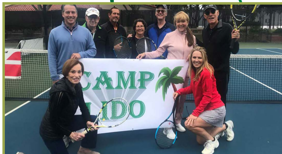
2019 CAMP LIDO – TENNIS PLAYERS ENJOYING A GREAT DAY ON THE COURTS IN SANTA BARBARA