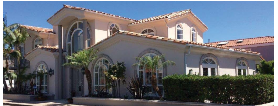
417 VIA LIDO NORD SOLD REPRESENTED SELLER