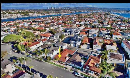
116 Via Genoa 3 Bed | 2 Bath | 40' lot | $2,425,000*