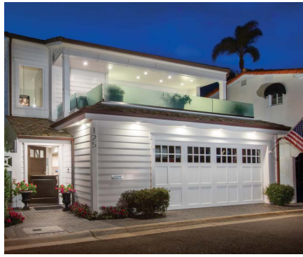
125 VIA MENTONE | NEW LISTING Lido Isle | Offered at $3,395,000 4 Bed | 4 Bath | 2,945 Approx. Sq. Ft.