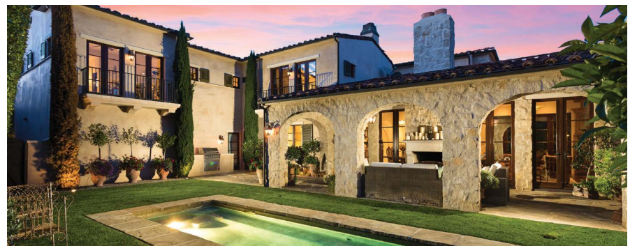
123 VIA FLORENCE FOR SALE $6,495,000/FOR LEASE $22,500/MO