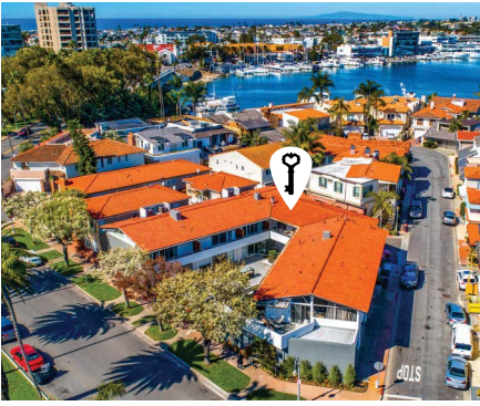
117 - 127 VIA ANTIBES Lido Isle | Offered at $7,995,000 Six Unit Condo Complex