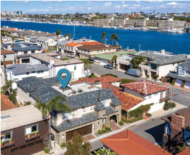
225 Via Quito, Lido Isle $4,195,000 | 4-BR, 5-BA | Web# 19054068